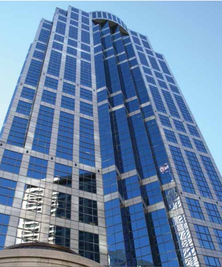
HIGH RISE COMMERCIAL BUILDINGS